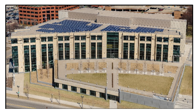
MINNESOTA SENATE BUILDING SOLAR PV INSTALLATION

While we want all agencies to meet these goals, we realize that some agencies may only meet some goals and not others. To ensure all agencies are successful, the Office of Enterprise Sustainability is charged with removing barriers, developing tools, and providing technical planning assistance. Yet, agencies won't be penalized for falling short of a goal.